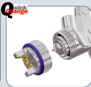
SATA® QC™ Quick Change™ – quick air cap change with just one and a half turns.