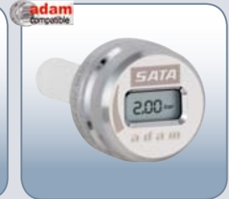
SATA® adam™ available as retrofit accessory – digital air micrometer to upgrade standard spray guns.