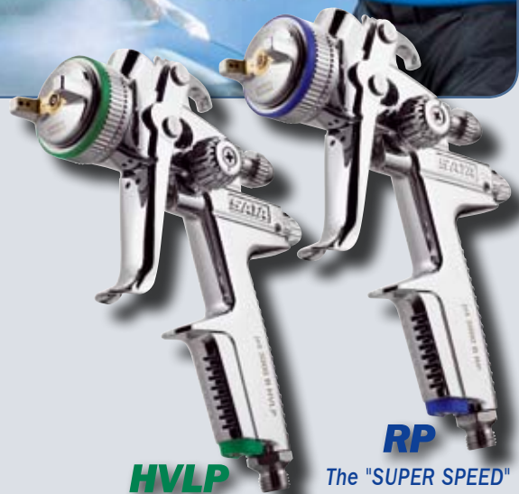
HVLP The "SUPER SAVER"