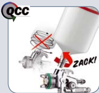
QCC™ cup connection – quick cup exchange, easy cleaning – only the original is equipped with the red ring.