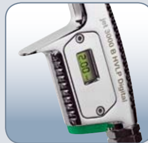
Available option: DIGITAL® version – integrated pressure measurement and adjustment – indispensable for perfect colour match.